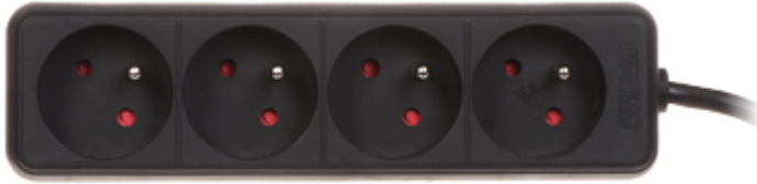
CEE 7/7 plug: