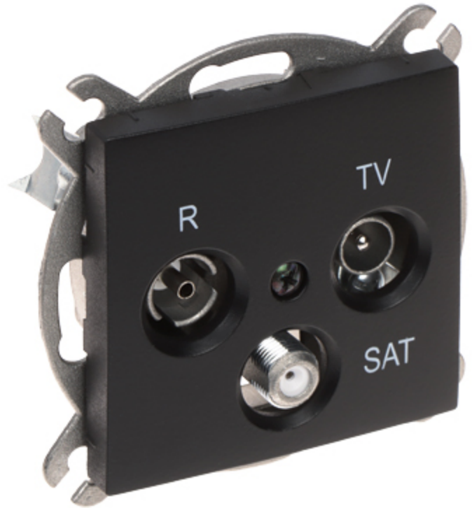
R-TV-SAT final aerial socket.