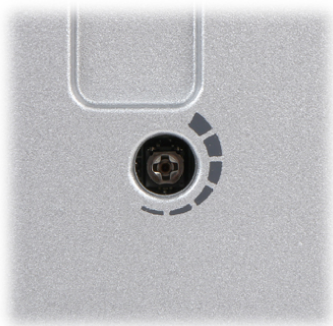
Door station: Front panel: