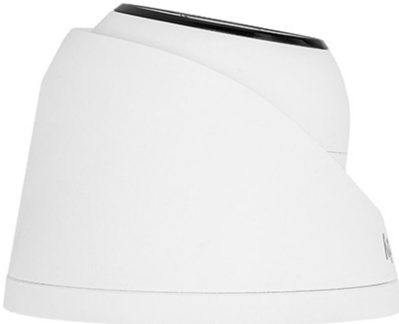
Mounting side view