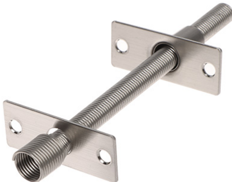
Metal spring protector for cable.

The device must be secured against contact with caustic, staining and viscous fluids.