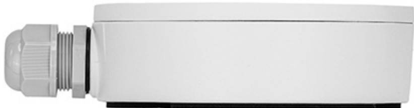
View without the front cover: