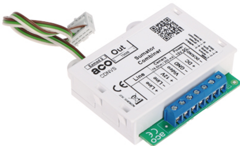
Combiner starting the digital video system bus.

The device must be secured against contact with caustic, staining and viscous fluids.