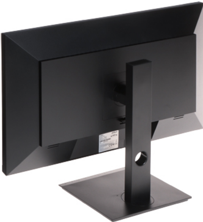
OSD menu control keys