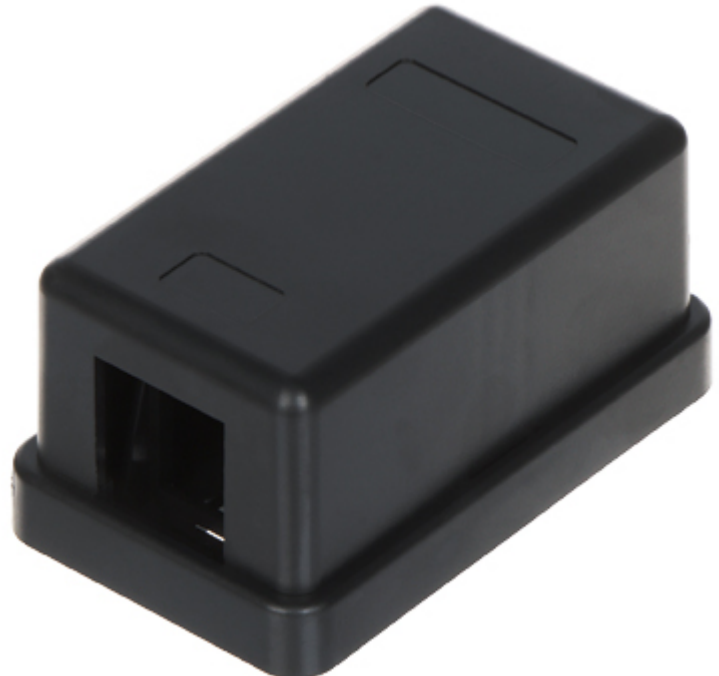
Mount box for KEYSTONE connectors.

The device must be secured against contact with caustic, staining and viscous fluids.