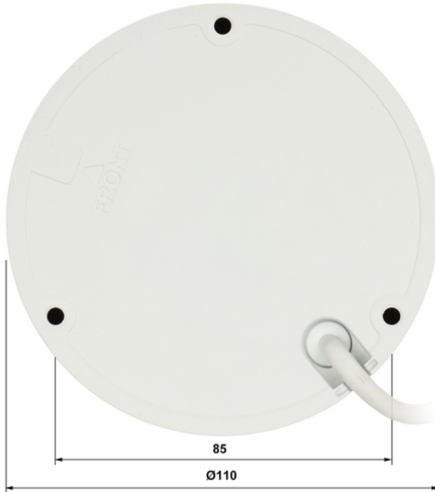
Example captures of device interface