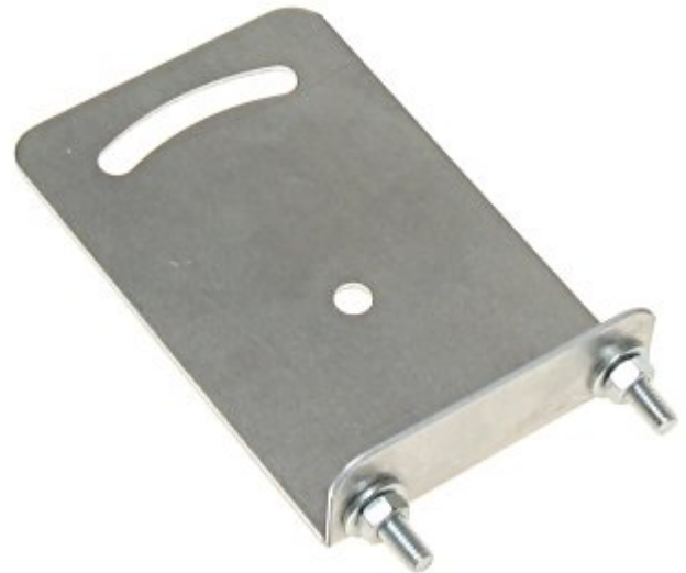
Bracket to ATK-P1/2.4-3M antennas with angle adjustment.

The device must be secured against contact with caustic, staining and viscous fluids.