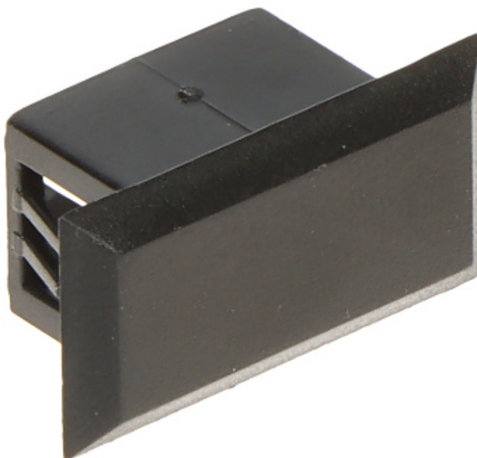
Dummy plug SC.

The device must be secured against contact with caustic, staining and viscous fluids.