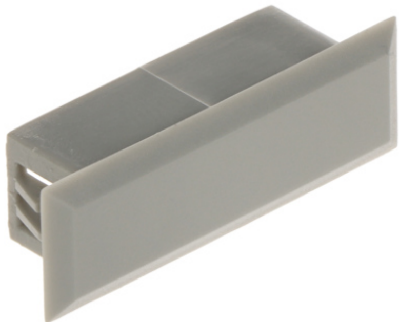
Dummy plug SC duplex.

The device must be secured against contact with caustic, staining and viscous fluids.