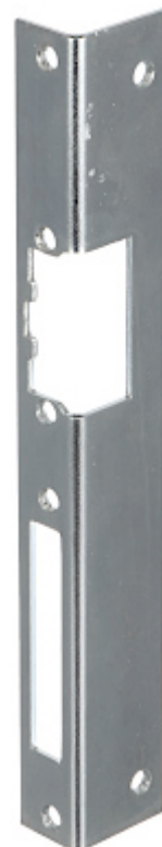
Angular, long, left plate adapted for left-hand door. Plate is zinc coating covered.

The device must be secured against contact with caustic, staining and viscous fluids.