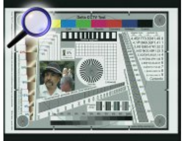
For VGA 1280x1024 resolution