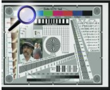
For VGA 800x600 resolution