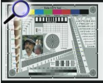
For VGA 1024x768 resolution