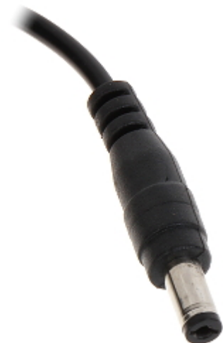
2.1/5.5mm plug polarization: