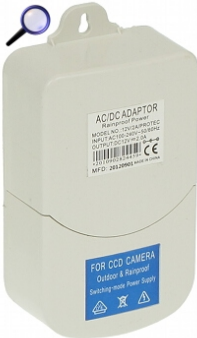
Internal view, after remove the cover: