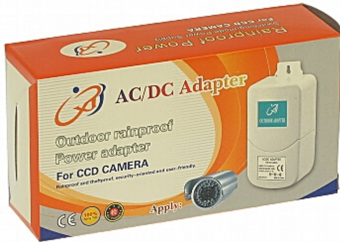
2.1/5.5mm plug polarization: