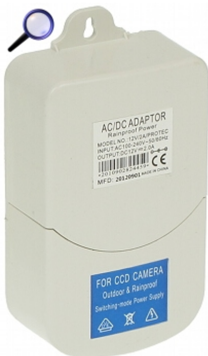
Internal view, after remove the cover: