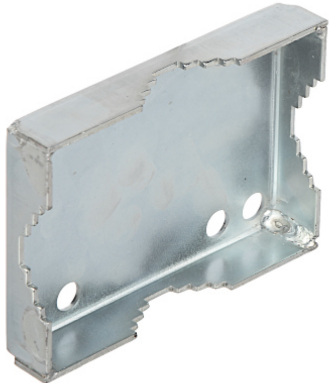
Universal mounting element for mast.

The device must be secured against contact with caustic, staining and viscous fluids.