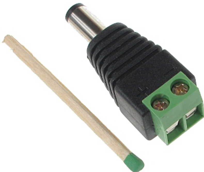
Example of use with YAP-2x0.5/100 cable: