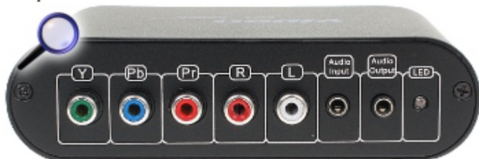
Example of device using: