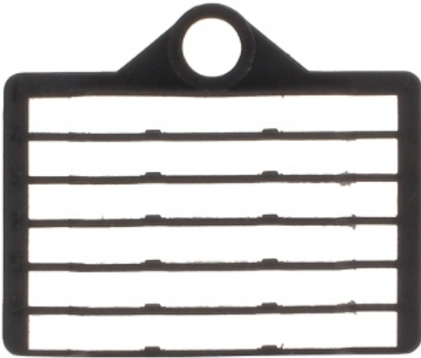
The Splice Holders mounted in PPKS-12 Splice Tray: