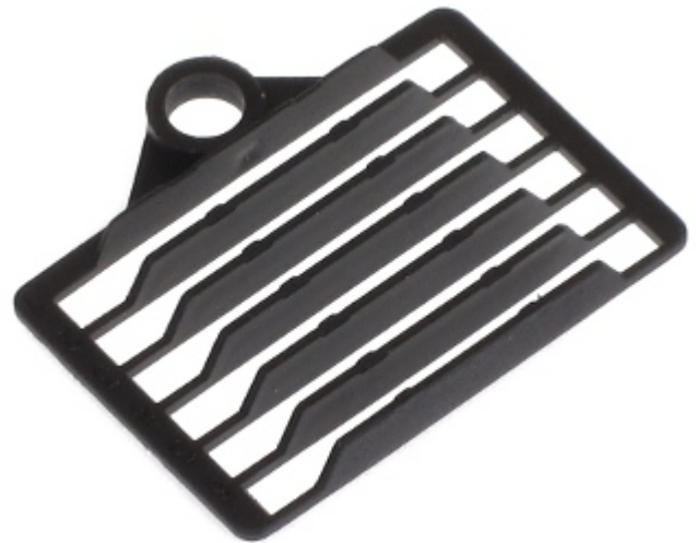
Mechanical splice holder compatible with PPKS-12 Splice Tray.

The device must be secured against contact with caustic, staining and viscous fluids.