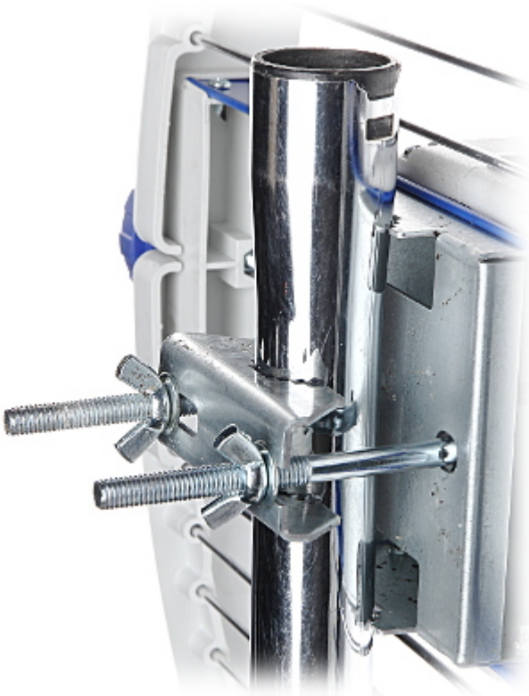
Omnidirectional antenna characteristics: