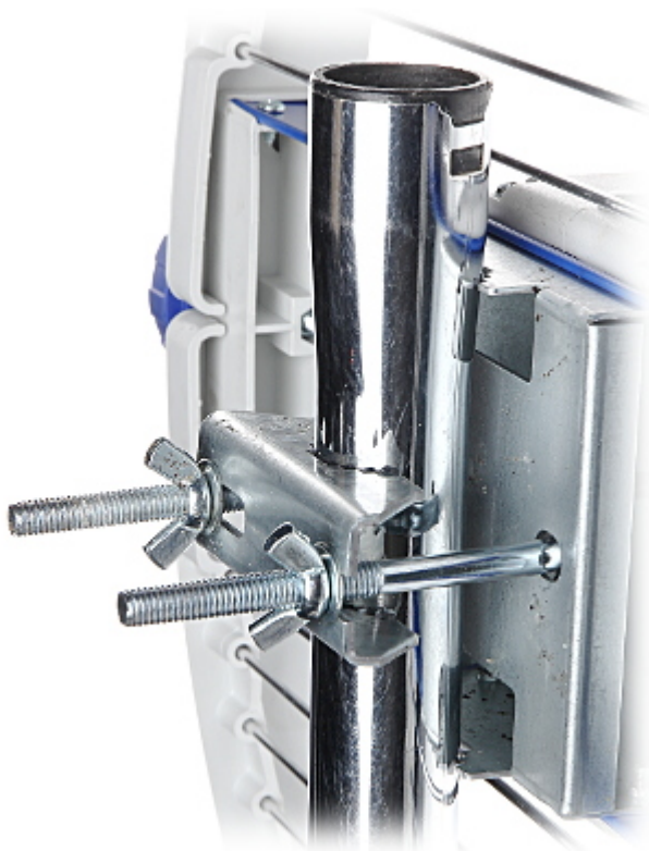
Omnidirectional antenna characteristics: