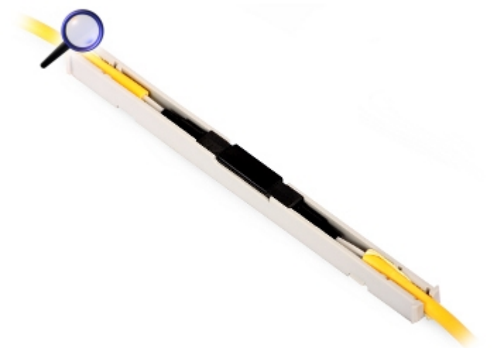
View of the protector in closed position: