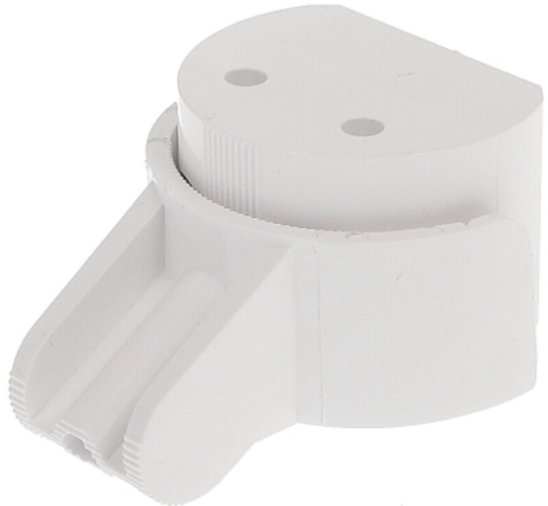
Bracket for motion detectors.

The device must be secured against contact with caustic, staining and viscous fluids.