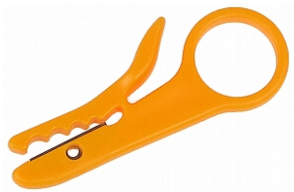
Insulation stripper for cables: UTP, YTKSY