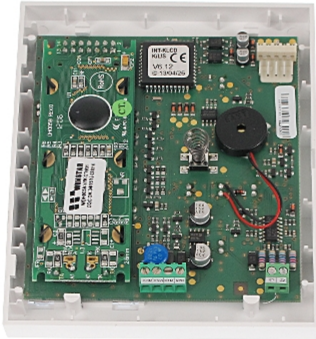
Mounting side view