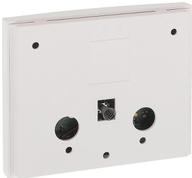
Fig. 1. Keypad CA-5-BLUE-S