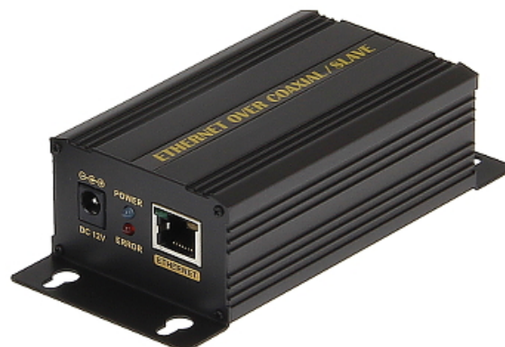
The 15-EOC101S transmitter for Ethernet transmission via coaxial cable.

To return a worn-out product, use a collection and disposal system of this type of equipment or contact a seller from whom it was purchased. He will then be recycled in an environmentally-friendly way.