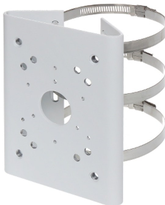
Mount designed to camera installation on a pole.

The device must be secured against contact with caustic, staining and viscous fluids.