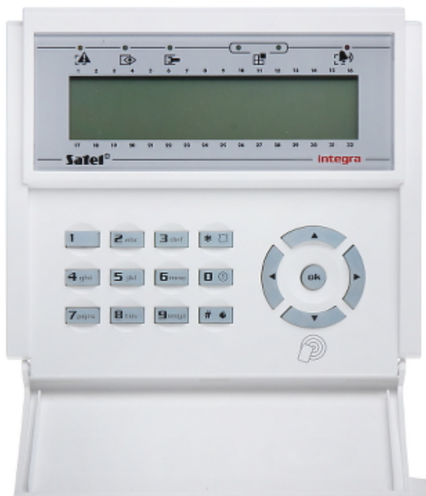
View after open the cover: