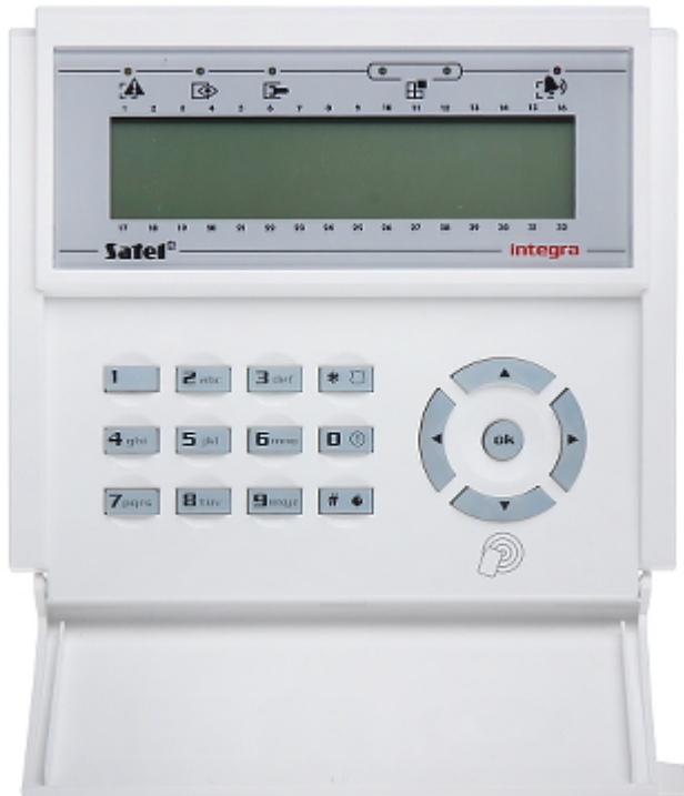
View after open the cover: