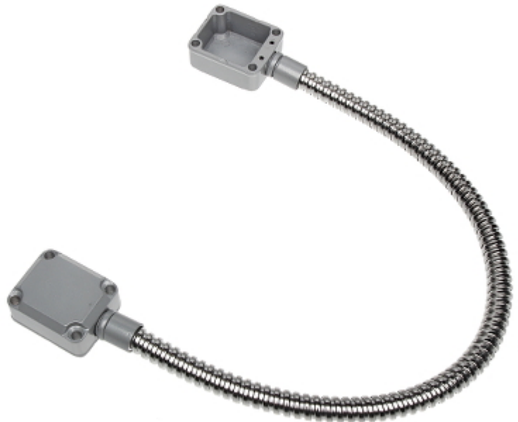
Metal protector for cable.

The device must be secured against contact with caustic, staining and viscous fluids.