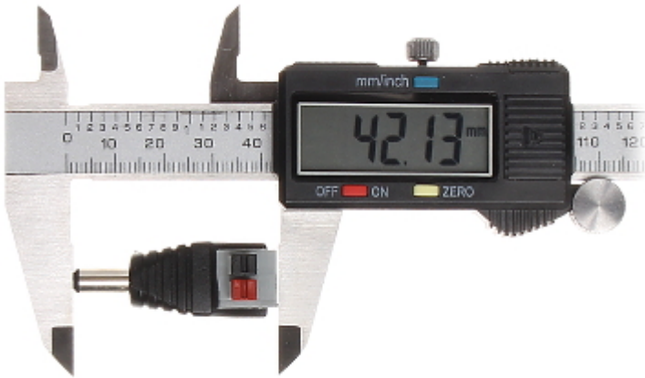
Example of use with YAP-2x0.5/100 cable: