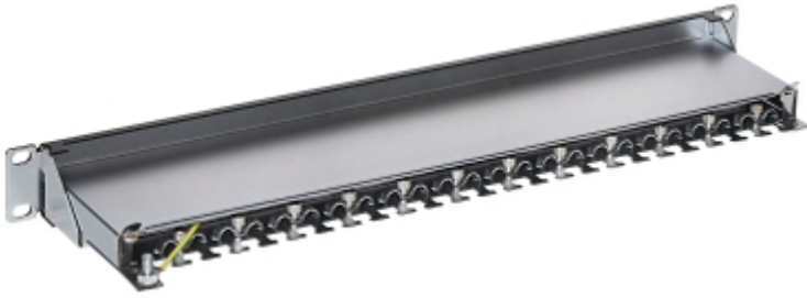
Internal view, after remove the cover: