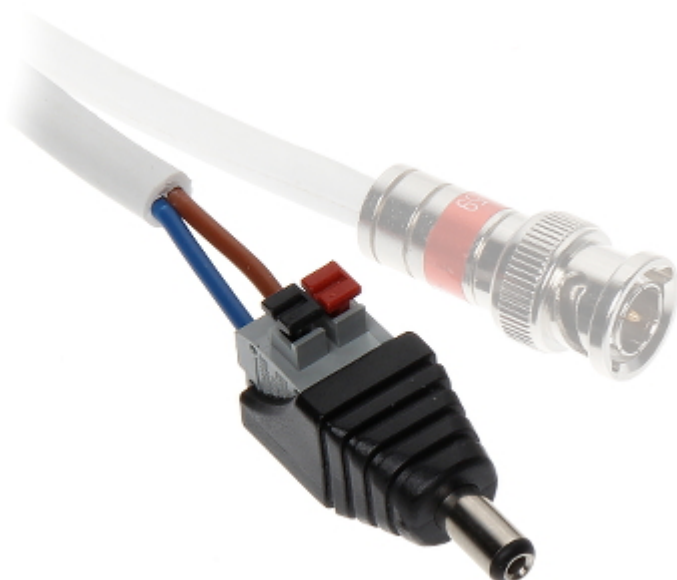
Camera connection example: