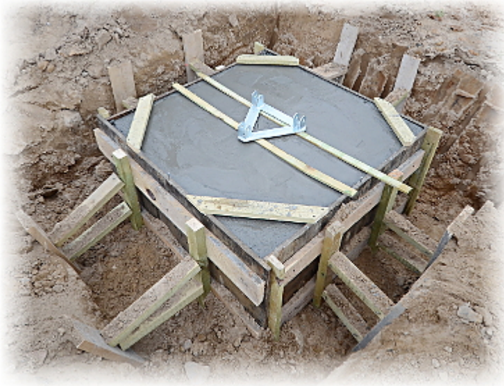
Ready foundation with the set mast