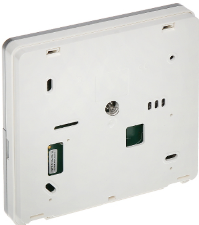
View after remove the cover: