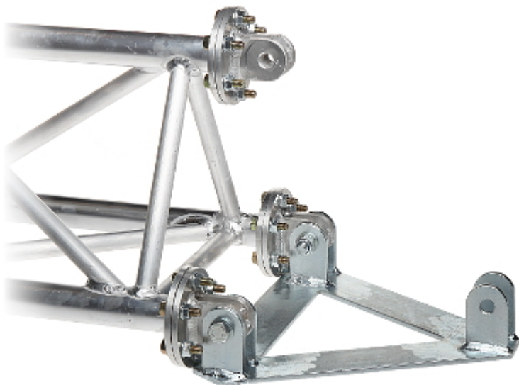
Prepared form-work for the foundation of the mast: