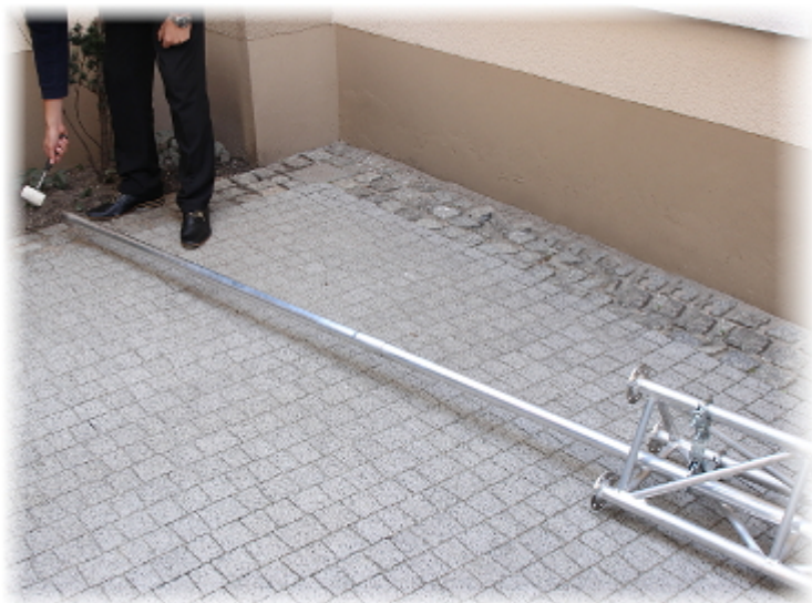
The combination of a truss mast with a pipe mast: