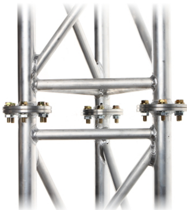
Pipe masts are combined on a wedge: