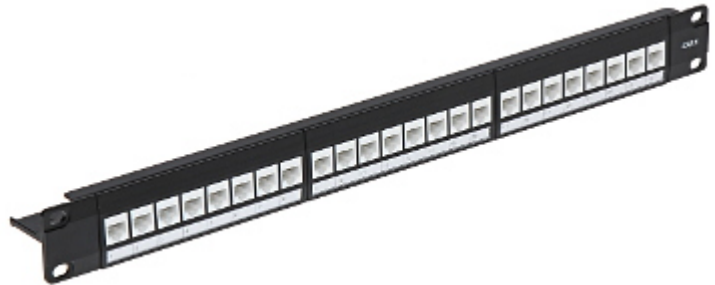
Patch panel with KEYSTONE RJ-45 connectors.

The device must be secured against contact with caustic, staining and viscous fluids.