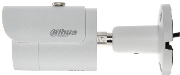
Camera mounting side view: