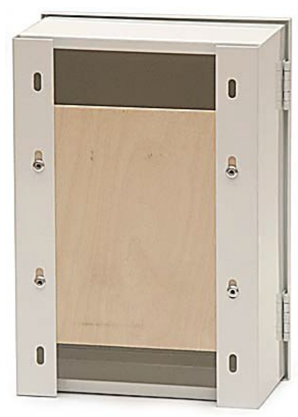
View from the mounting side (box to the wall distance visible):