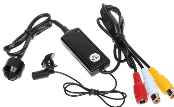
Color micro camera equipped with external microphone on the cable. Camera is equipped with PINHOLE type lens, needs only a very small hole to get right field of view.

To return a worn-out product, use a collection and disposal system of this type of equipment or contact a seller from whom it was purchased. He will then be recycled in an environmentally-friendly way.