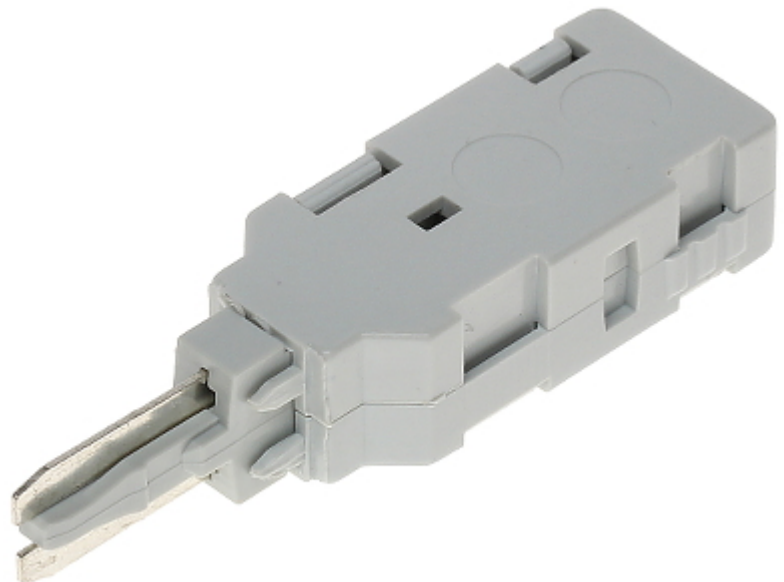
Measuring connector for couplers LSA type.

The device must be secured against contact with caustic, staining and viscous fluids.