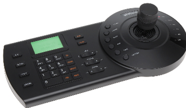
Network keyboard with full possibilities of controlling and programming the PTZ camera heads of the DH-SD series. It is also possible to control many DVRs from one keyboard.

To return a worn-out product, use a collection and disposal system of this type of equipment or contact a seller from whom it was purchased. He will then be recycled in an environmentally-friendly way.