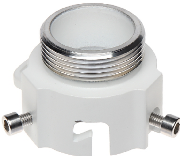
Bracket connecting the Speed Dome type camera to the adapter or other Dahua / BCS thread bracket.

The device must be secured against contact with caustic, staining and viscous fluids.