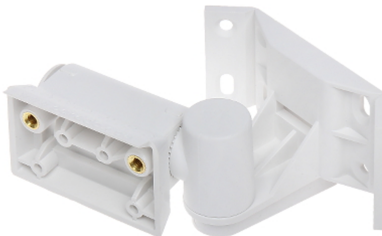
Bracket for motion detectors.

The device must be secured against contact with caustic, staining and viscous fluids.