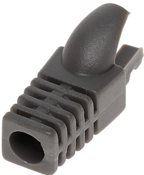
Example of application: