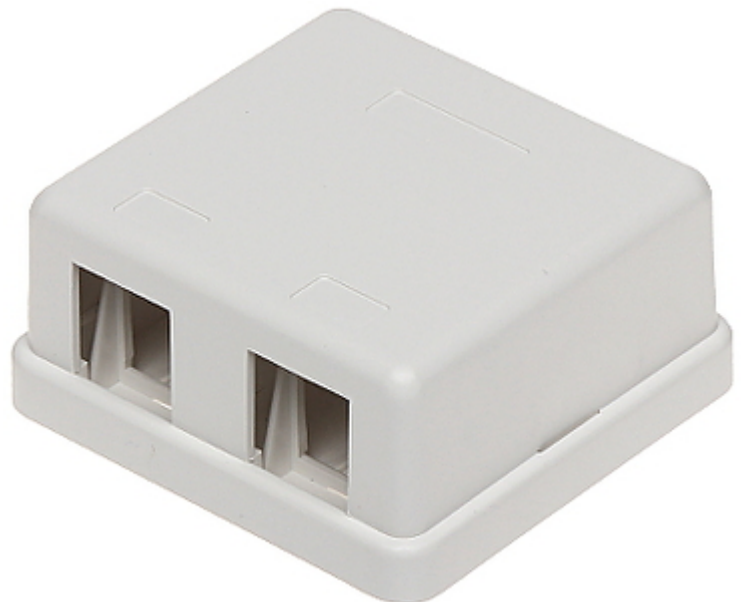
Mount box for KEYSTONE connectors.

The device must be secured against contact with caustic, staining and viscous fluids.