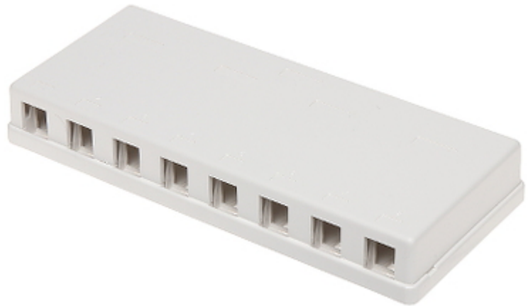
Mount box for KEYSTONE connectors.

The device must be secured against contact with caustic, staining and viscous fluids.