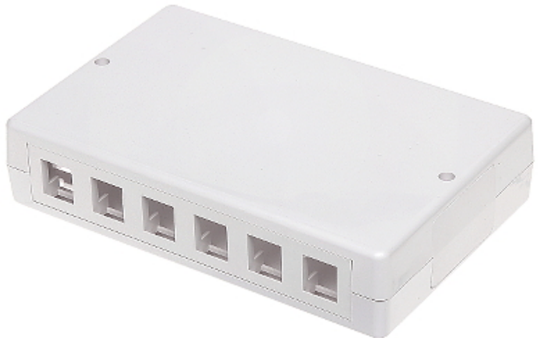
Mount box for KEYSTONE connectors.

The device must be secured against contact with caustic, staining and viscous fluids.